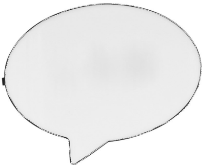
2. FRONT PD